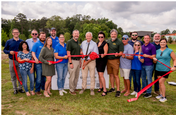
2025 - Walker DISC Golf Course Funds: $ 40,000

$ 87,400 funds * 1870 Volunteer Hours * 6060 + Impacted Plus $ 20,000 donations * 150 hours Gala team