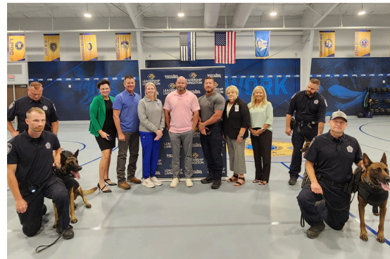
2025 - Bullet Proof Vests for K-9's Funds: $ 5,685